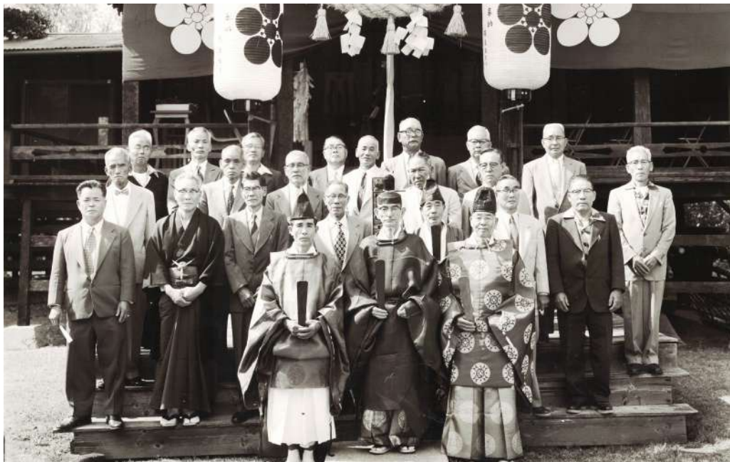
Hawaii Dazaifu Tenmangu Spring Festival held on March 25, 1956

Plans were initiated for the purchase of the Bishop Estate land behind the shrine for the construction of a